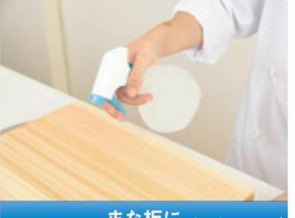
まな板に Cutting Board